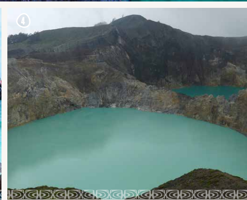
IMAGES 1 Moriones Mask, Marinduque Island, Philippines | 2 Kuching Wetlands | 3 Tinabo | 4 Ende, Crater Lakes