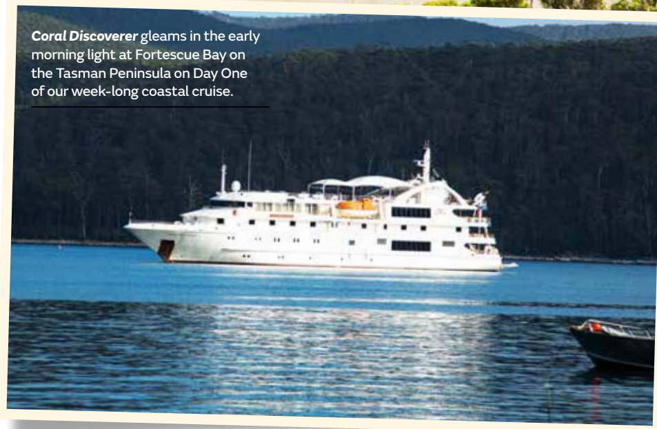
Coral Discoverer gleams in the early morning light at Fortescue Bay on the Tasman Peninsula on Day One of our week-long coastal cruise.

After sailing south from Hobart on a windy and choppy but sunny January evening, we're woken early the next morning to tackle a section of one of the island's newest walks, the Three Capes Track on the Tasman Peninsula. It opened for business in December 2015 and features a well-constructed track in excellent condition. We trek from Fortescue Bay to Cape Hauy and back again, a moderately rated hike of 4–5 hours that starts from the boat ramp near the bay's popular campsite. All the walkers are shuttled ashore across calm waters in Coral Discoverer's spacious tender, which is launched via an ingenious