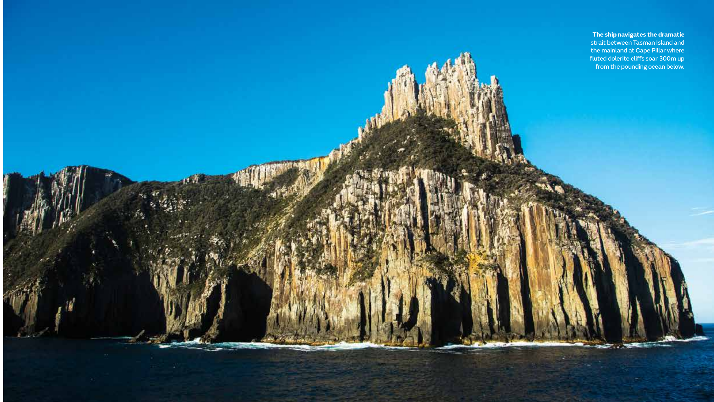
The ship navigates the dramatic strait between Tasman Island and the mainland at Cape Pillar where fluted dolerite cliffs soar 300m up from the pounding ocean below.

N EXT MORNING WE arrive at Coles Bay, tucked under the towering pink granite peaks of the The Hazards on the Freycinet Peninsula. We hike up to the famous Wineglass Bay lookout with the usual crowds but we're early enough to avoid the worst of the daytripper traffic. We continue down the other side of the saddle via a steep track towards the bay's celebrated arc of white quartzite sand. Today, big breakers are smashing onto the beach and only the very strongest swimmers among us brave the wild waters and swarms of bluebottles on this otherwise perfect summer morning.