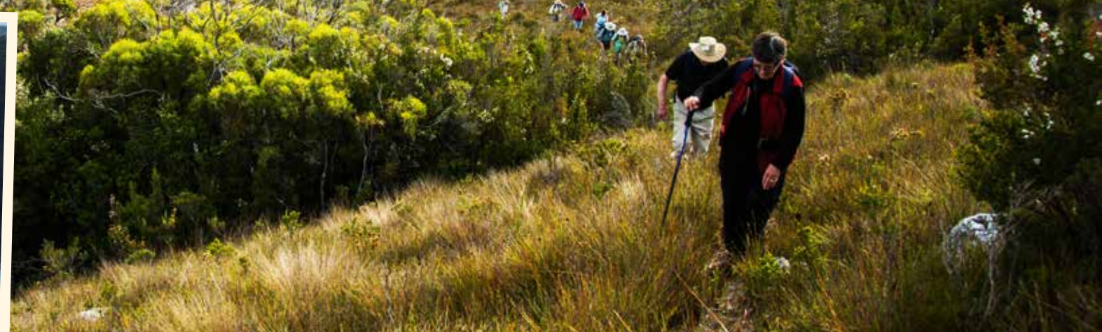
▼ Coral Expeditions' walking guide Mark Steadman leads the bushwalkers up Mt Milner high above Port Davey, the broad bay that leads to Bathurst Harbour. This region can only be reached by boat, small aircraft or on foot, a tough hike of more than seven days.

The views revealed by the low-lying coastal heath vegetation are spectacular. It's just possible to make out the peaks of Maria Island far away to the north. To the south Tasmania's verdant landmass comes to an abrupt end, plummeting down to the