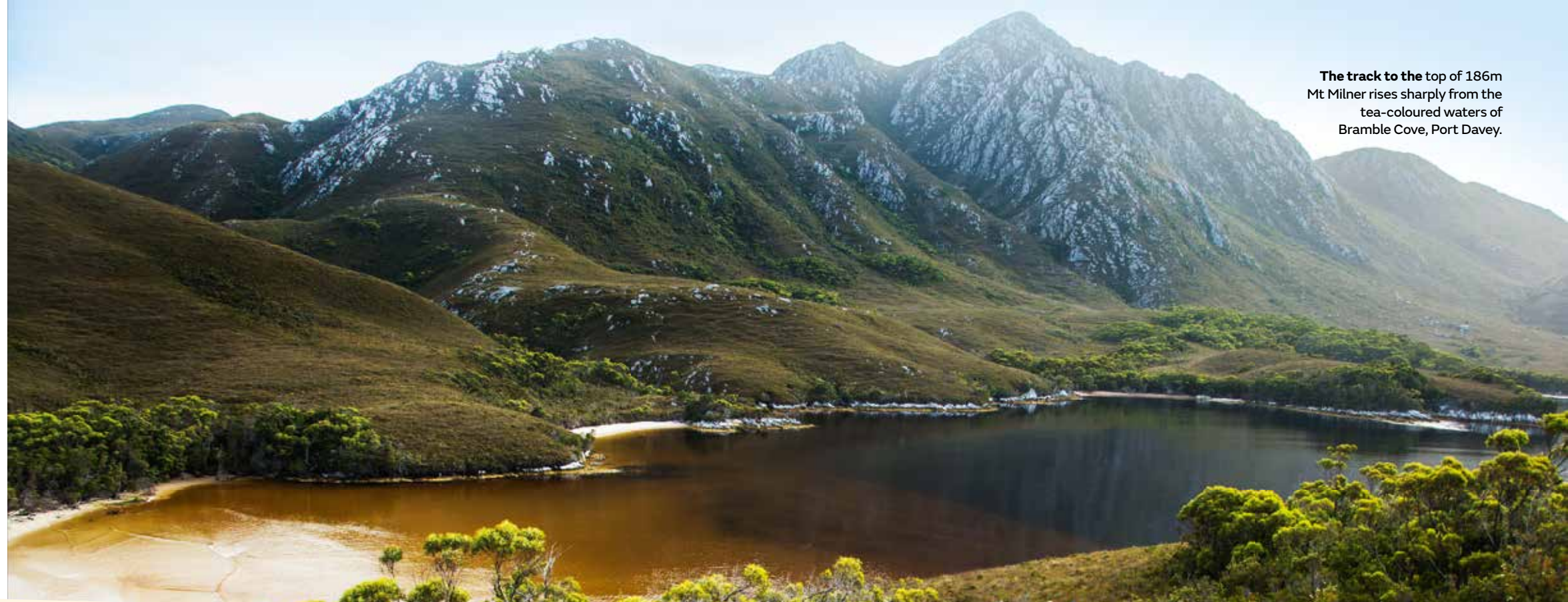
The track to the top of 186m Mt Milner rises sharply from the tea-coloured waters of Bramble Cove, Port Davey.

T ASMANIA IS REGARDED as a bushwalkers' paradise, and arguably boasts Australia's highest concentration of internationally renowned short and multi-day walks. But if you're new to walking the Apple Isle, it's not always easy to pick the most suitable track to get you started, especially if you're unsure of your own fitness and suitability to tackle the famously rugged terrain and unpredictable weather conditions.