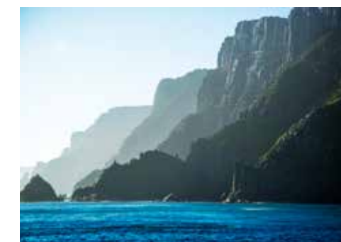
Guide Katharine Byrne (left, at left) identifies features that can be seen from atop Fluted Cape on Bruny Island. The towering cliffs at the southernmost tip of the Tasman Peninsula (above) are the tallest in the Southern Hemisphere.